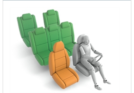
Römer King II LS (Belt)