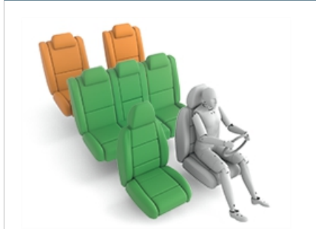
Maxi Cosi Cabriofix & EasyBase2 (Belt)