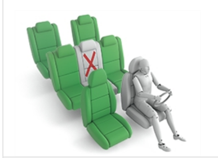
BeSafe iZi Kid X4 ISOfix (ISOFIX)