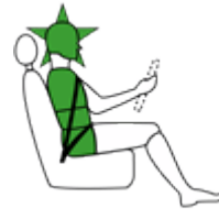
Side impact driver