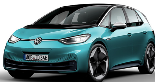
The new electric VW ID.3 achieved the best overall score in Euro NCAP safety tests in 2020

The stay-at-home economy has created a surge in demand for delivery services and, with more commercial vans on city roads, the number of crashes involving vans has gone up. For years, the safety of commercial vans has been lagging behind that of passenger cars, both in terms of system fitment and performance. This is particularly true for driver assistance systems. In 2020, nineteen vans, covering 98 percent of European sales, were tested in accordance with Euro NCAP 2018 Safety Assist protocols. The best vans tested were the Volkswagen Transporter, Ford Transit and Mercedes-Benz Vito. The FIAT Talento, Renault Trafic, Renault Master, Opel Movano and Nissan NV400 were not recommended, as they are very poorly equipped or have no driver support systems available.